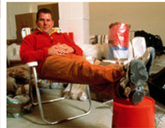
Estate of Jason Rhoades