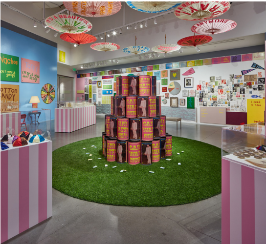
Cary Leibowitz: Museum Show , January 26–July 25, 2017, installation view. Organized by The Contemporary Jewish Museum, San Francisco.

Tag: Proposals on Queer Play and the Ways Forward will be on view February 2 through August 12, 2018. Cary Leibowitz: Museum Show and Broadcasting: EAI at ICA will be on view from February 2 through March 25, 2018. Expanded information on each exhibition follows below.