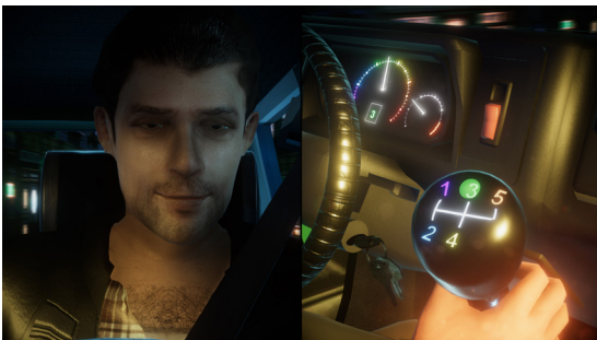
Robert Yang, Radiator 2 (still), 2017, video game.