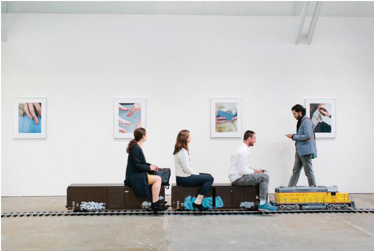
Installation view. Courtesy CCA Wattis Institute.

In the context of the gallery, it could be said that the composition, lighting, and general style of Josephine Pryde's photographs recall fashion and portrait photography, but this would ignore the fact that fashion and portrait photography refer to art photographs, snapshots, documentary footage, and more. Or, as the artist and writer Melanie Gilligan put it in her recent essay "The Overt and the Obstinate," "certain of Pryde's pictures mobilize some of photography's most debased popular cultural forms in order to crash them and produce newly assembled relations from the wreckage."